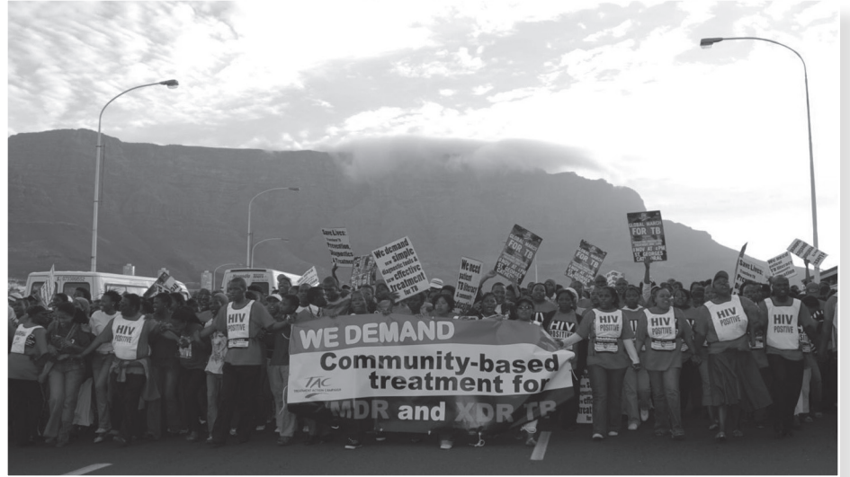
Activists from around the world marched to the 38th World Conference on Lung Health to demand global action on TB, TB/HIV, and multi-drug resistant (MDR) and extensively drug resistant (XDR) TB in Cape Town, South Africa, on November 8, 2007.

The plan was announced with enthusiasm at the World Economic Forum in Davos, endorsed by the United Nations General Assembly special session