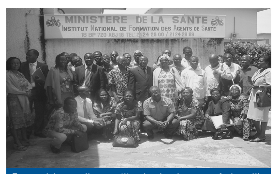
To address the critical shortage of health care professionals in Côte d'Ivoire, PEPFAR collaborated with the National Training Institute for Health Care Workers (INFAS) to support the hiring of 35 instructors at 3 INFAS locations. These skilled instructors have eased the burden on medical personnel and allowed the faculty to introduce best practice methods through regular oversight, assess areas of need for improved student development, and provide a combination of theory and practice for optimal capacity development.