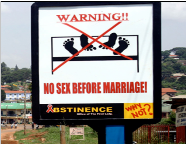
Your Taxes at Work in Kampala

The divvying up of HIV prevention funding is rather convoluted and results in a strong religious bias: Under the law that established the President's Emergency Plan for AIDS Relief (PEPFAR), 20% of total PEPFAR appropriations have to go to prevention activities. And one-third of these prevention grants is reserved for programs espousing abstinence-until-marriage. Since the State Department focuses one-half of the HIV prevention moneys on sexual transmission, abstinence advocacy dominate that field.